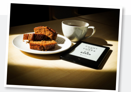
April book choice – 'Count to Three' by T.R. Ragan