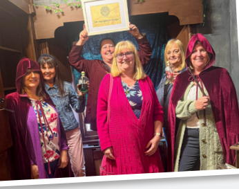
April My Time – Escape Rooms!